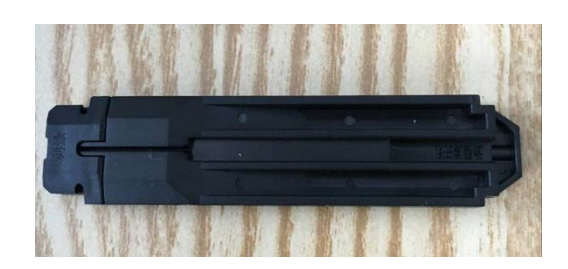
Fiber-cutting Tool(Integrated optical fiber cutting and length fixed function)