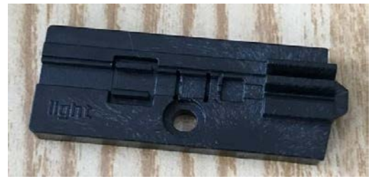
(Fiber length fixed device, standby)